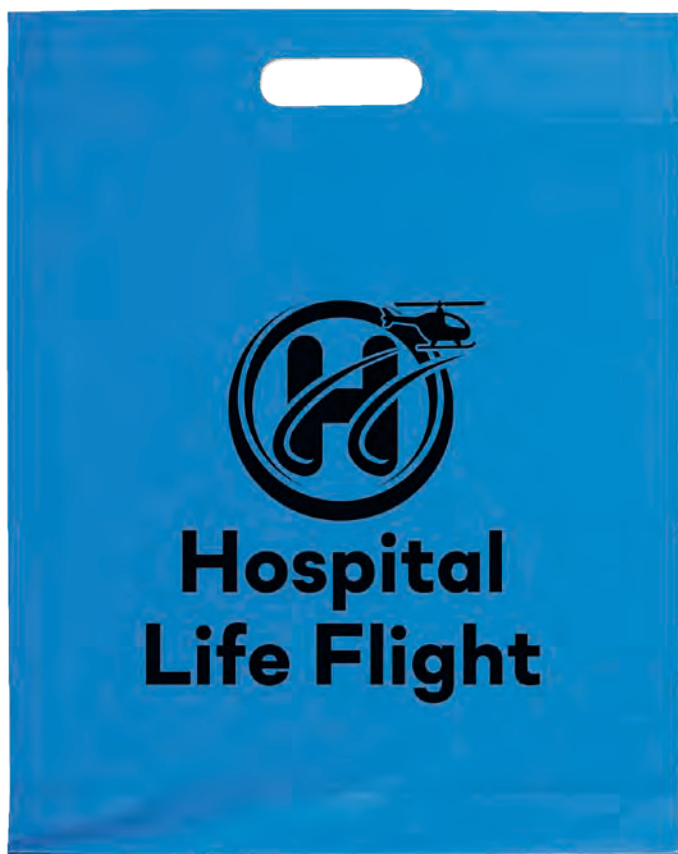
15W x 19H x 3