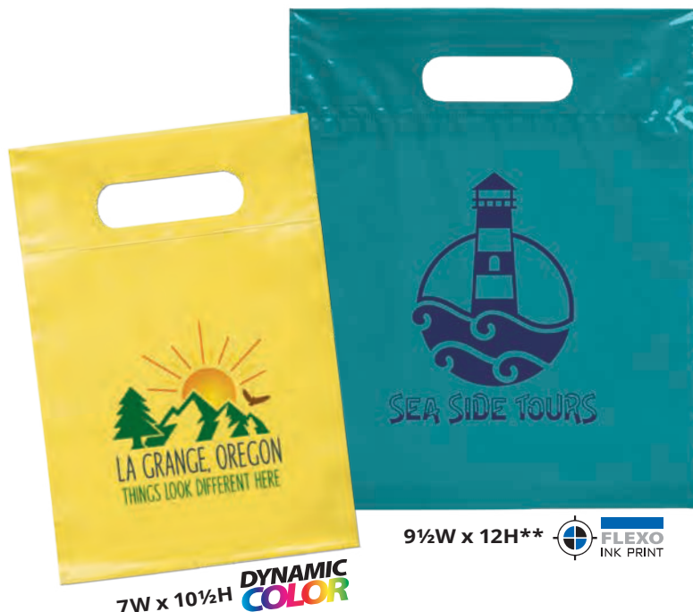
7W x 10½H DYNAMIC COLOR

These 2.5 mil lo-density plastic bags feature fold-over reinforced die cut handles. Bottom gusset is available on select sizes.